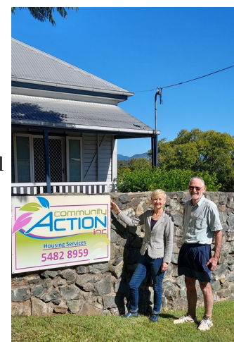
Discussing the potential for Solar System at the Nash St.